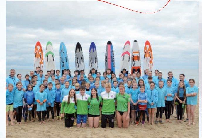
Wicklow Surf Lifesaving pictured with five Team Ireland members who represented Ireland at the European Junior Championships in Poland.