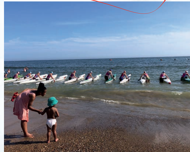
Starting Young – Interested spectators watch as athletes take to the water at the National Surf Lifesaving Championships in Youghal, Co. Cork.