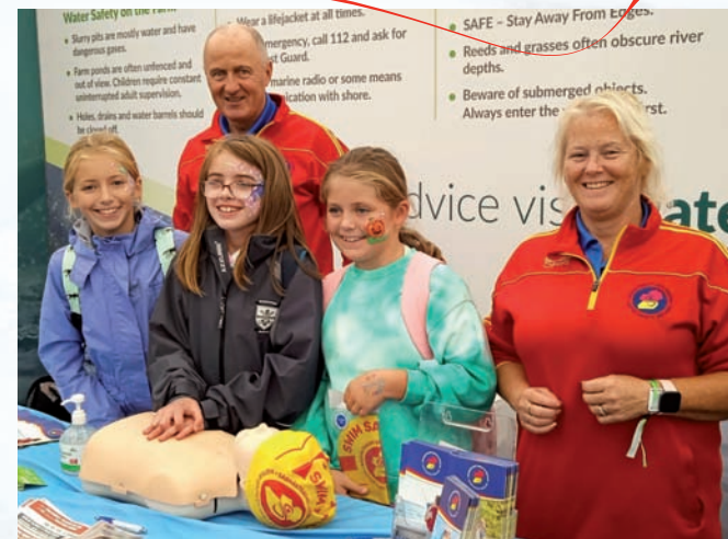
Volunteers from Water Safety Ireland – Laois providing demonstrations at the National Ploughing Championships 2023 in Ratheniska, Co. Laois.