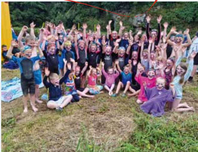
A combined effort at Graiguenamanagh summer swim week in Co. Kilkenny for World Drowning Prevention Day.