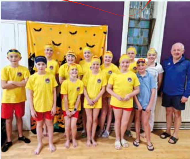
Future lifeguards in training - water safety classes in Mount Wolseley Hotel, Tullow, Co. Carlow.