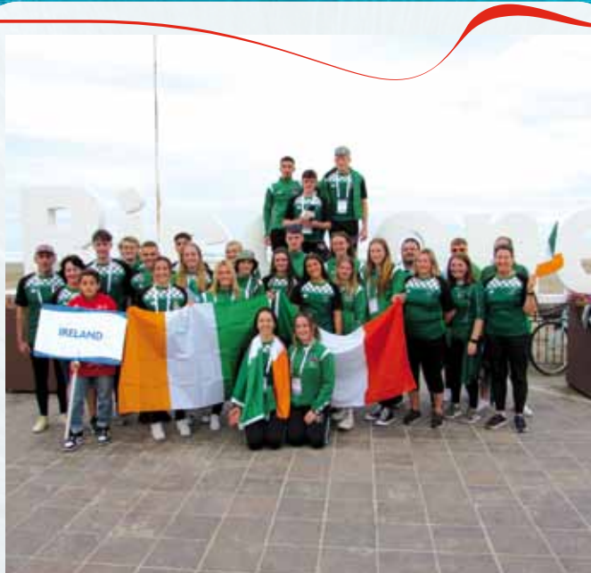
Representing their country - Members of Team Ireland at the opening ceremony of the World Surf Lifesaving Championships in Riccione, Italy.