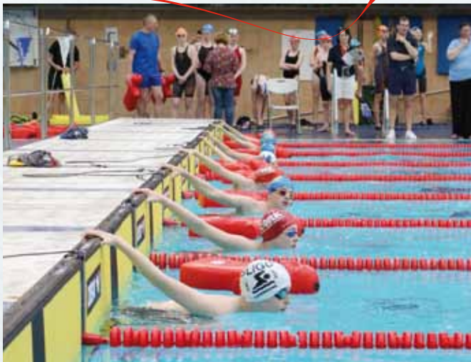
All set, ready to go at the finals of the National Nipper Stillwater Championships at the UL Sports Arena, Co. Limerick.