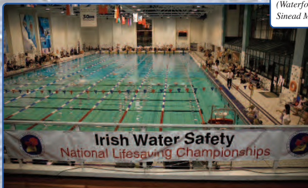
Irish Water Safety trained Lifesavers break the still waters of the University of Limerick's 50-metre pool as they compete in the National Pool Lifesaving Championships 2008. Teams from counties around Ireland compete in a rigorous series of races, which simulate conditions that lifesavers often encounter in real life rescues and are designed to test the lifesaving skills of the participants.