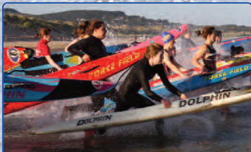
The grimaces at a compacted starting line quickly give way to steadfast concentration as competitors at the National Surf Lifesaving Championships have their skills tested in events that simulate emergency rescue and swimming scenarios.