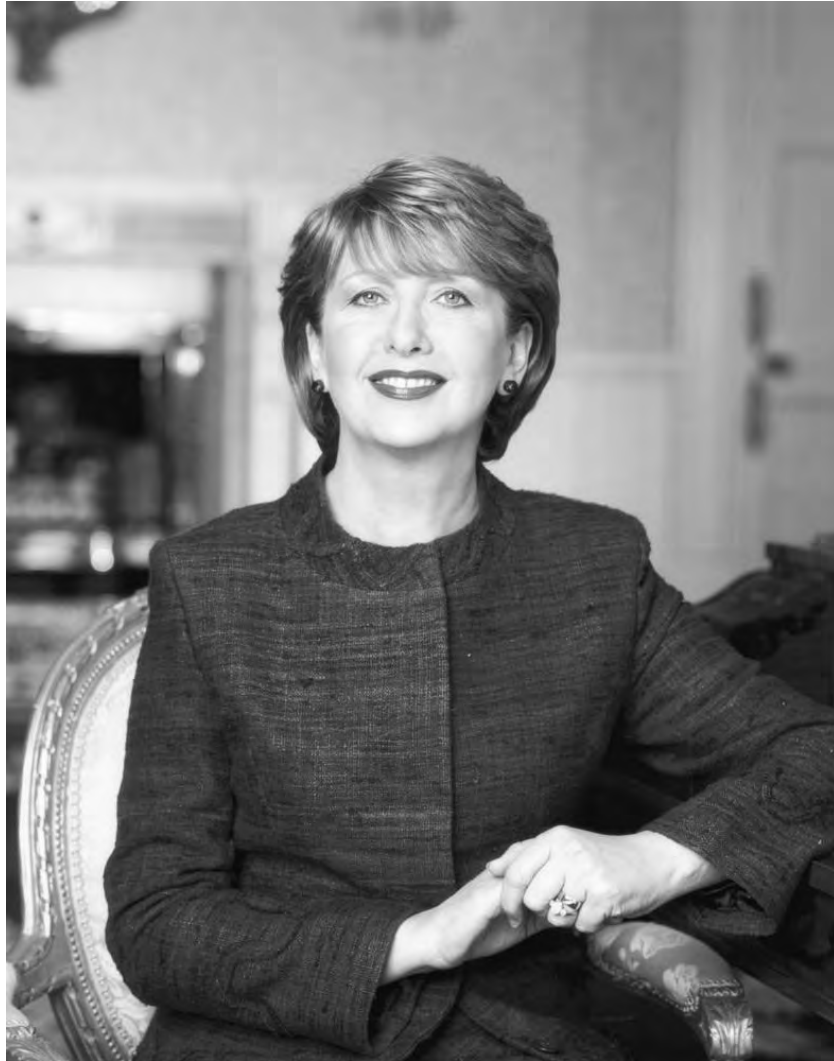
Mary McAleese, President of Ireland (Patron of Irish Water Safety)