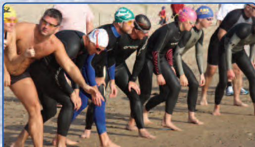
Seconds to the signal for Irish Water Safety trained Lifesavers competing in the National Surf Lifesaving Championships, hosted by Wicklow Water Safety Area Committee at Brittas Bay. Competitors contend with challenging open water conditions to rescue potential "casualties" in testing swim races, rescue board races and other events, which culminate in exciting finals throughout the day.