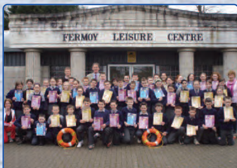
Pupils from Dungourney National School, Fermoy, Co Cork receive their Primary Aquatics Water Safety (PAWS) Certificates at Fermoy Leisure Centre where they learnt their water safety skills. Teaching children water safety best practices safeguards their lives and is Irish Water Safety's proactive step to moulding a generation's attitude and behaviour around aquatic environments.