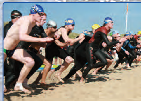
The wait is over. Months of training honing their lifesaving skills, Irish Water Safety trained Lifesavers compete for the best start at the National Lifesaving Championships at Brittas Bay, Co Wicklow. Conditions around Ireland's coast are ideal training waters for the teams vying for National Championship medals.