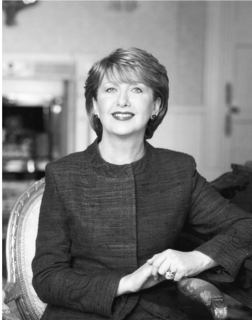
Mary McAleese, President of Ireland (Patron of Irish Water Safety)