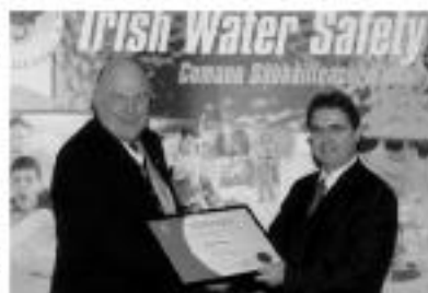
International Olympic Council recognises the voluntary effort of IWS to promote water safety.

The Chairman is also Honorary Auditor of ILS and attended the headquarters in Belgium to audit their accounts. The Chairman was subsequently appointed a European Director of the World Board of ILS.