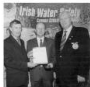
Three men in suits standing together, one holding a certificate or award. A banner in the background reads 'Irish Water Safety Congress 2001'.

International Life Saving (Europe) Board meeting - Croatia International Life Saving (Europe) Commission meeting - Scotland