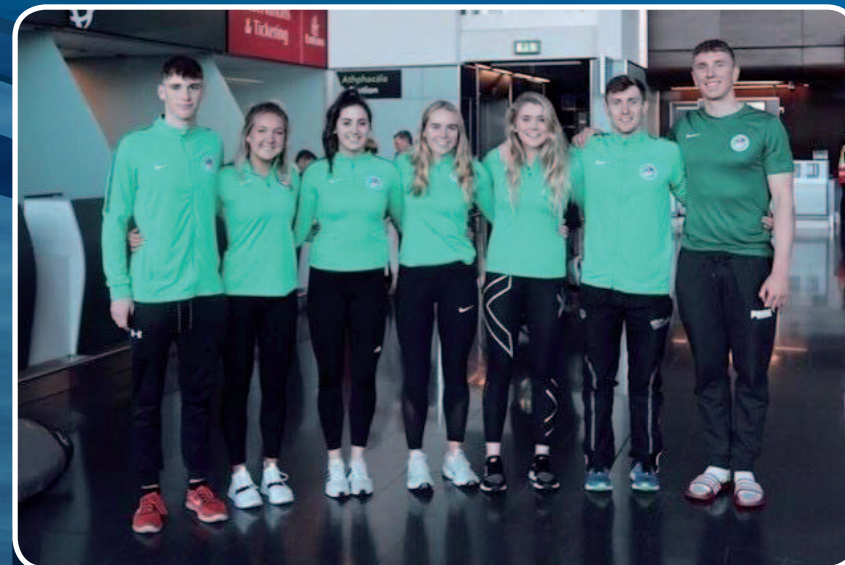
The Irish Lifesaving Team on their way to the 2018 World Lifesaving Championships in Adelaide, Australia.

Supported by the County Councils of Wexford, Wicklow, Donegal, Tipperary, Fingal, Limerick City & County, Kilkenny, Mayo, Clare and the Galway Water Safety Area Committee.