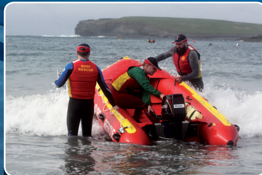
Some of the Rescue Crew hard at work at the European Junior Lifesaving Championships at Kilkee Beach, Clare.