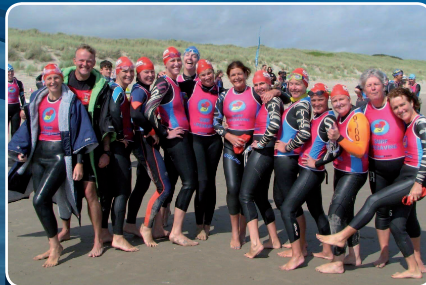
Some of the Cork Lifesaving Team competing at the 2018 National Lifesaving Championships at Curracloe Beach, Wexford, featuring a photo bomber from Clare.

Supported by the County Councils of Wexford, Wicklow, Donegal, Tipperary, Fingal, Limerick City & County, Kilkenny, Mayo, Clare and the Galway Water Safety Area Committee.