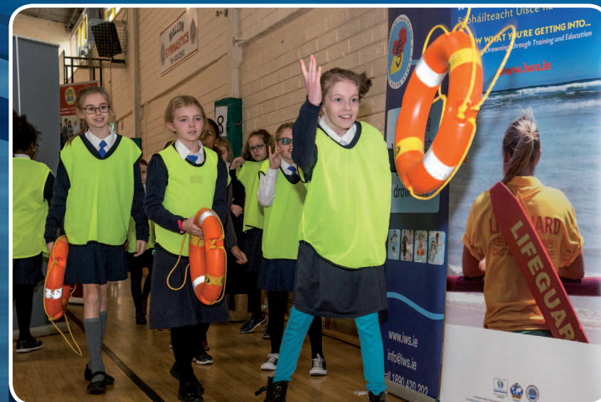
Students from Mallow, Cork, having fun and building their water safety knowledge by learning how to stay safe in and near water.

Supported by the County Councils of Wexford, Wicklow, Donegal, Tipperary, Fingal, Limerick City & County, Kilkenny, Mayo, Clare and the Galway Water Safety Area Committee.