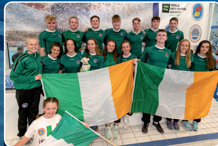
The Irish Lifesaving Team getting ready to compete in the European Junior Lifesaving Championships which was hosted in Ireland last year.

Supported by the County Councils of Wexford, Wicklow, Donegal, Tipperary, Fingal, Limerick City & County, Kilkenny, Mayo, Clare and the Galway Water Safety Area Committee.