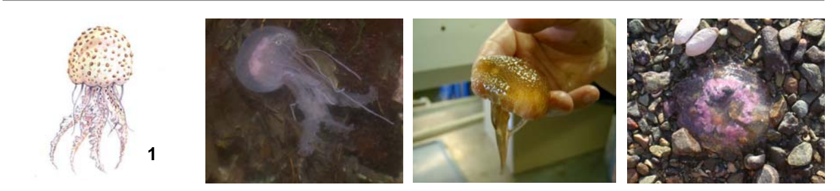
Species 6: Pelagia jellyfish ( Pelagia noctiluca ): Bell has warts or bumps on it. Very small jellyfish, about the size of a closed fist, up to 10cm in diameter. Has only eight tentacles. Occurs autumn/winter. Similar to the common jellyfish, however they occur at different times of the year. Warning: Can sting