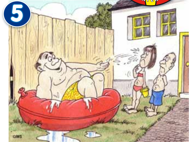
An adult should always supervise playtime