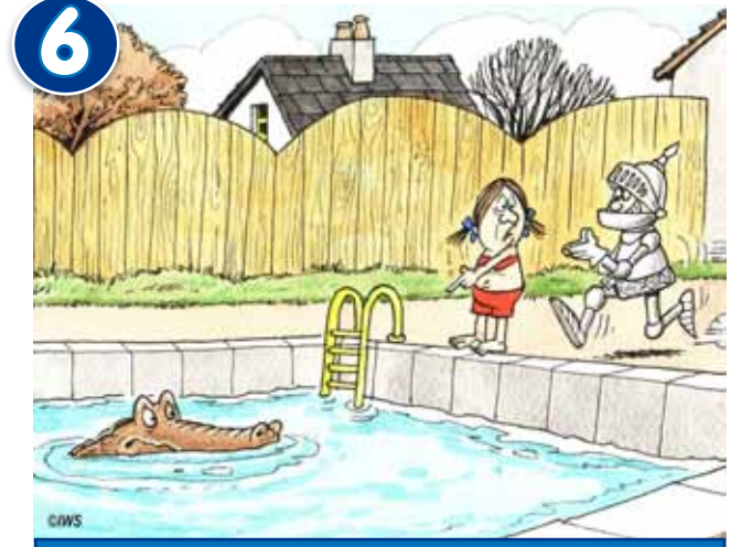
Remember to check for others before entering the water

Remember these rules – Enjoy yourself – Come home safely