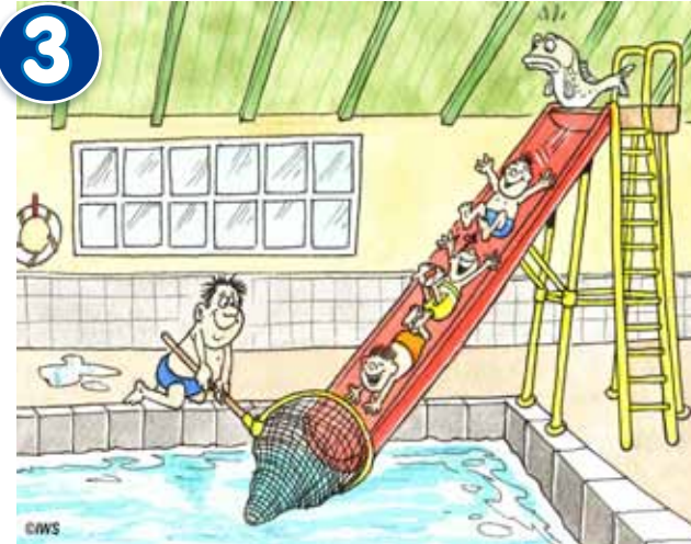
Watch out for younger children at all times