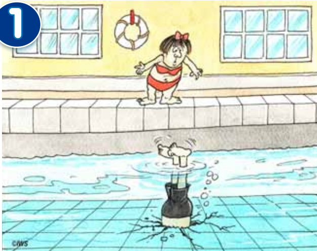
Be careful not to dive into shallow water