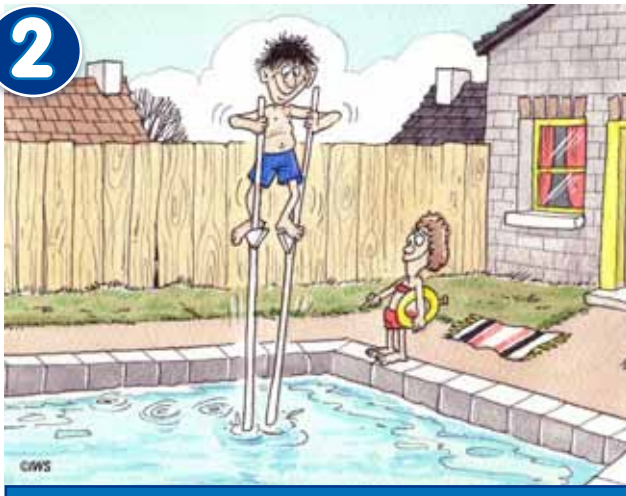
Check to see how deep the pool is before getting in